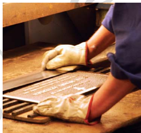
Linishing with abrasive belt